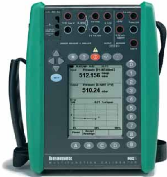
MC5 Multifunction Calibrator