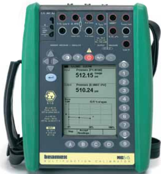
MC5-IS Intrinsically Safe Multifunction Calibrator